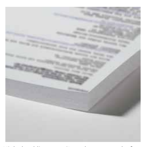
High shredding capacity makes easy work of shredding larger quantities of paper in one go