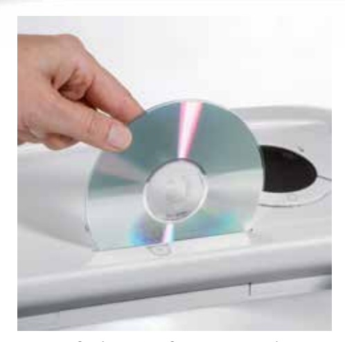
Separate feed opening for CDs, DVDs, cheque and credit cards guarantees reliable shredding of optical, magnetic and/or electronic data carriers