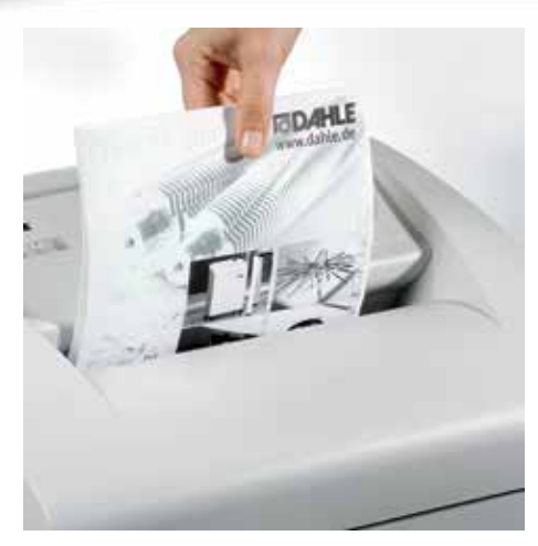
Standardised entry widths take all common paper sizes