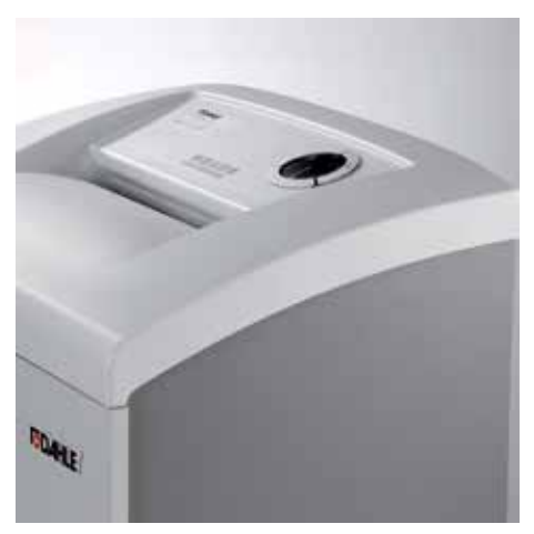
Modern design blends into any working environment.