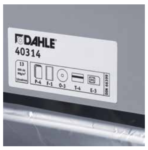
Clearly labelled performance characteristics on the top of the shredder help to ensure correct document shredder operation