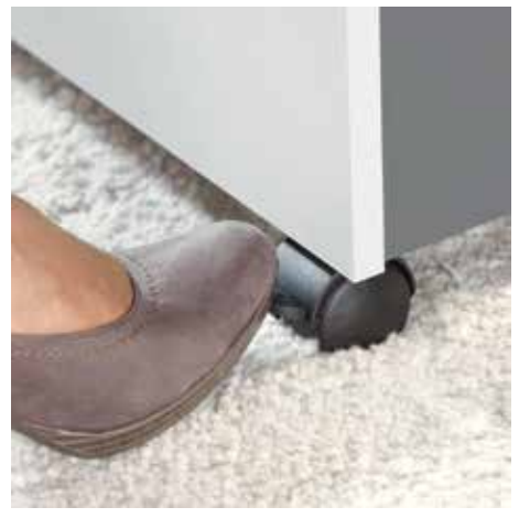
Convenient swivel casters providing 5 cm floor clearance for greater mobility and two brakes for reliably keeping the shredder firmly in place at the point of use