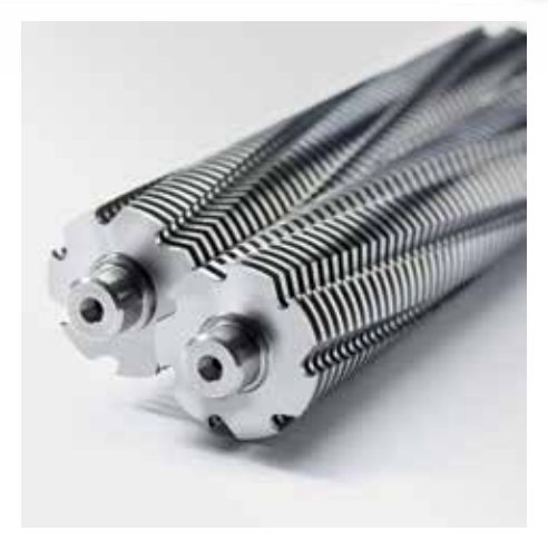
High-quality, solid-steel cutters in special steel for a guaranteed long service life