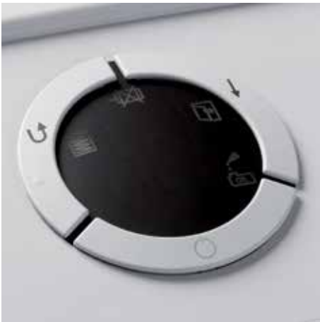
Clearly designed, user-friendly control panel permits easy, self-explanatory operation with illuminated symbols and acoustic signals