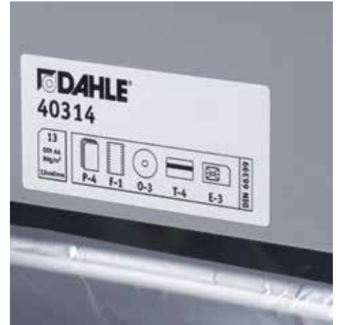
Clearly labelled performance characteristics on the top of the shredder help to ensure correct document shredder operation