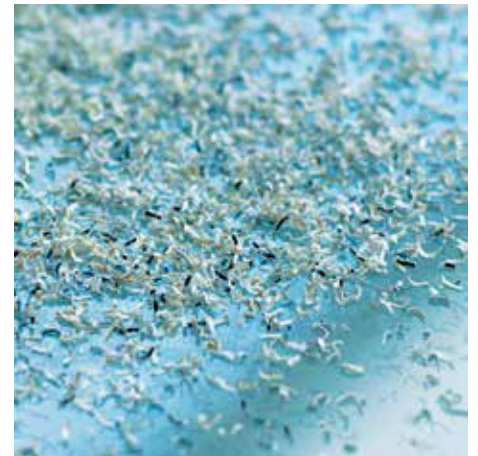
P-7 security: recommended for data media containing top secret data demanding maximum security measures