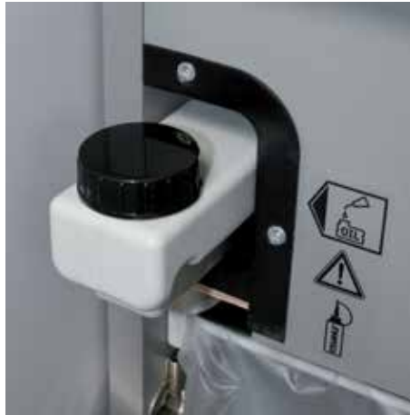
Integrated oil tank for controlled, automatic lubrication of the cross-cut cutters helps to lengthen service life while keeping performance constant