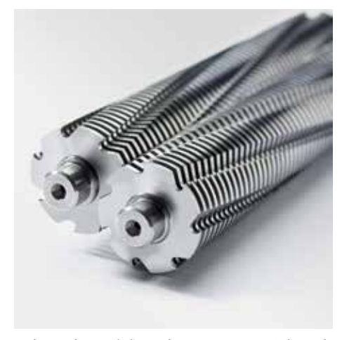
High-quality, solid-steel cutters in special steel for a guaranteed long service life