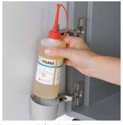
Environmentally friendly oil is always easy to access, included with all cross-cut models