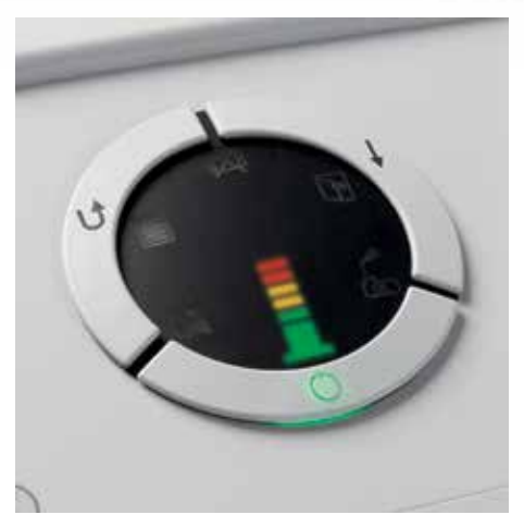
Paper quantity sensors prevent the document shredder from starting if too much has been fed in to avoid paper jams