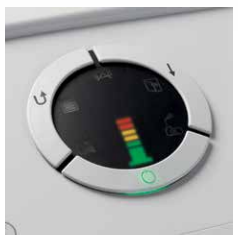
Paper quantity sensors prevent the document shredder from starting if too much has been fed in to avoid paper jams