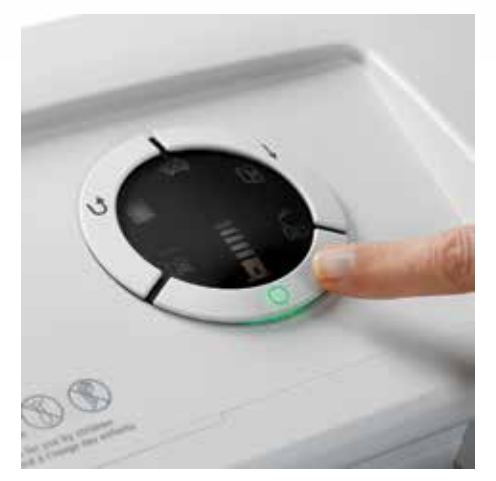
Clearly designed, user-friendly control panel permits easy, self-explanatory operation with illuminated symbols and acoustic signals