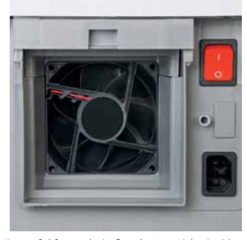
Powerful fan sucks in fine dust particles inside the document shredder and feeds them to the filter