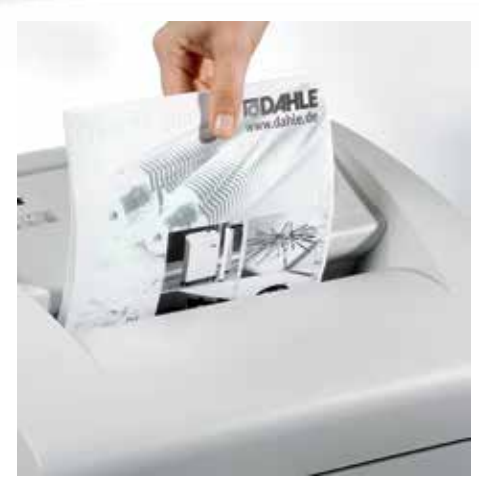
Standardised entry widths take all common paper sizes