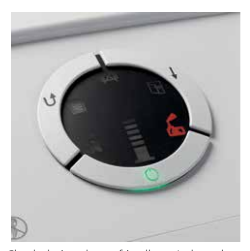
Clearly designed, user-friendly control panel signals oil refill