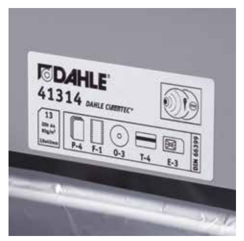
Clearly labelled performance characteristics on the top of the shredder help to ensure correct document shredder operation