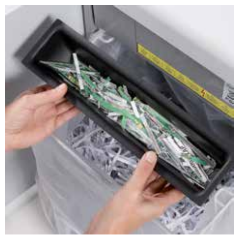
Separate, integrated waste boxes help to sort shredded paper, CDs, DVDs, cheque and credit cards for eco-friendly recycling