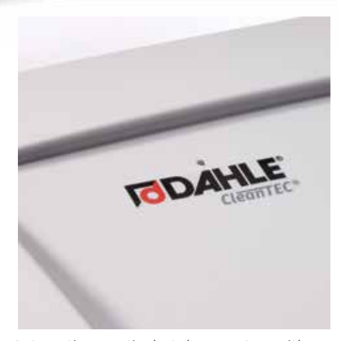
Automatic acoustic shut-down system with integrated microphone immediately stops the document shredder in an emergency in response to a call for help or knocks to the casing,