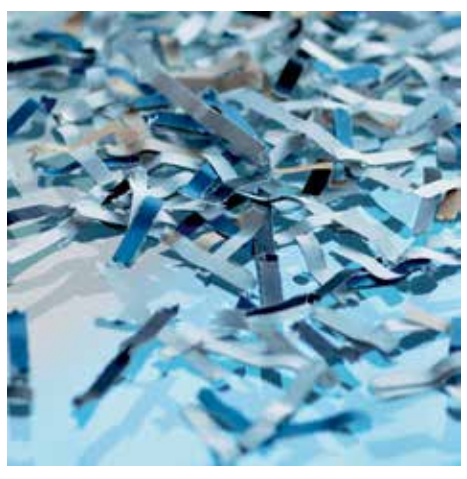
P-4 security: recommended, for example, for data media containing particularly sensitive, confidential and personal data