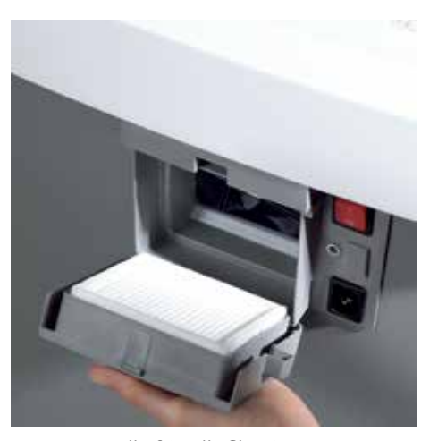
Environmentally-friendly filter is easy to change. A signal on the user-friendly control panel indicates when the fine dust filter needs changing