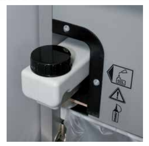
Integrated oil tank for controlled, automatic lubrication of the cross-cut cutters helps to lengthen service life while keeping performance constant