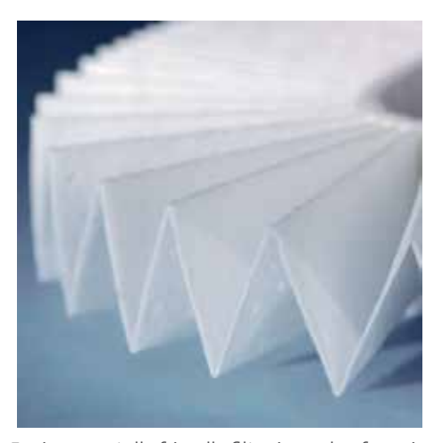
Environmentally friendly filter is made of special 3-ply, fully recyclable non-woven material