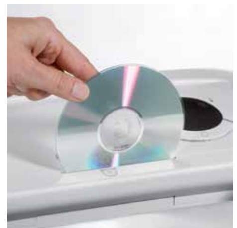
Separate feed opening for CDs, DVDs, cheque and credit cards guarantees reliable shredding of optical, magnetic and/or electronic data carriers