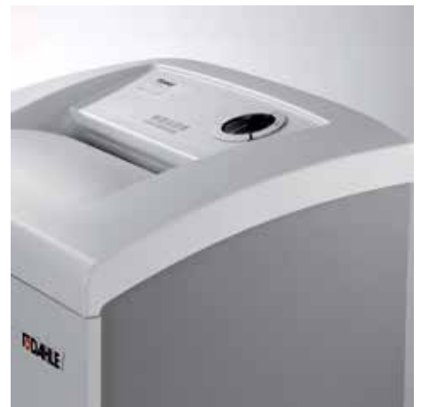
Modern design blends into any working environment.