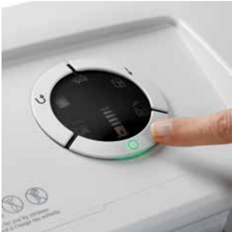
Clearly designed, user-friendly control panel permits easy, self-explanatory operation with illuminated symbols and acoustic signals