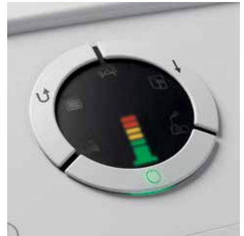
Paper quantity sensors prevent the document shredder from starting if too much has been fed in to avoid paper jams