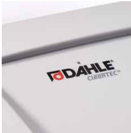
Automatic acoustic shut-down system with integrated microphone immediately stops the document shredder in an emergency in response to a call for help or knocks to the casing,