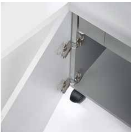
Wide opening door to easily empty the waste bag