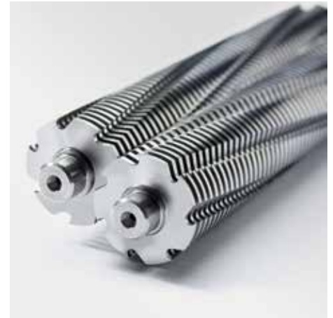
High-quality, solid-steel cutters in special steel for a guaranteed long service life