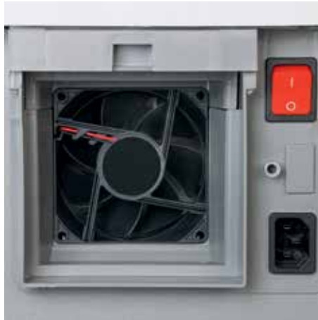
Powerful fan sucks in fine dust particles inside the document shredder and feeds them to the filter