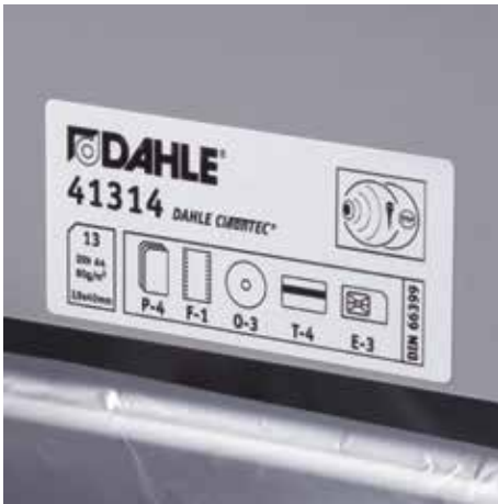
Clearly labelled performance characteristics on the top of the shredder help to ensure correct document shredder operation