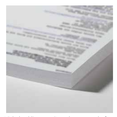
High shredding capacity makes easy work of shredding larger quantities of paper in one go