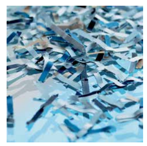
P-4 security: recommended, for example, for data media containing particularly sensitive, confidential and personal data