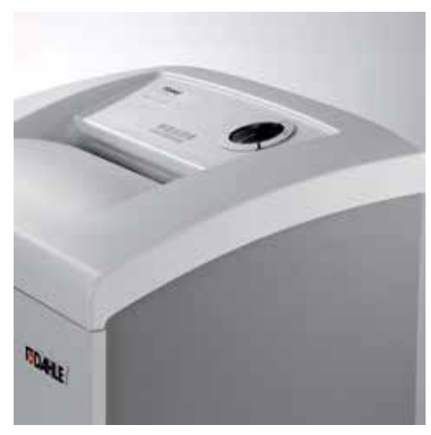
Modern design blends into any working environment.