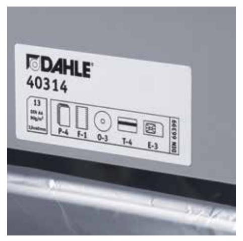
Clearly labelled performance characteristics on the top of the shredder help to ensure correct document shredder operation