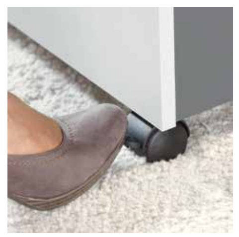
Convenient swivel casters providing 5 cm floor clearance for greater mobility and two brakes for reliably keeping the shredder firmly in place at the point of use