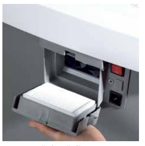
Environmentally-friendly filter is easy to change. A signal on the user-friendly control panel indicates when the fine dust filter needs changing