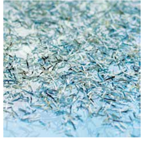
P-6 security: recommended for data media containing secret data demanding exceptionally stringent security measures