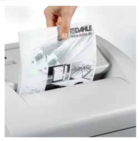
Standardised entry widths take all common paper sizes