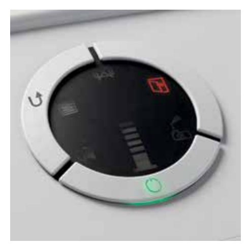
Visual and acoustic signal indicates open door