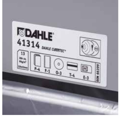
Clearly labelled performance characteristics on the top of the shredder help to ensure correct document shredder operation