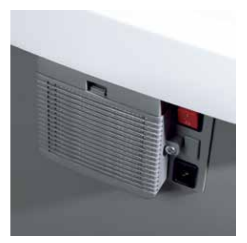
Unique DAHLE CleanTEC® filter system filters and effectively binds fine dust particles to create a better indoor environment.