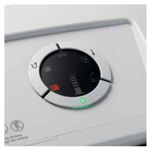
Clearly structured, user-friendly control panel indicates when the fine dust filter needs changing