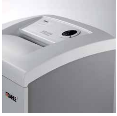
Modern design blends into any working environment.