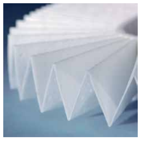
Environmentally friendly filter is made of special 3-ply, fully recyclable non-woven material