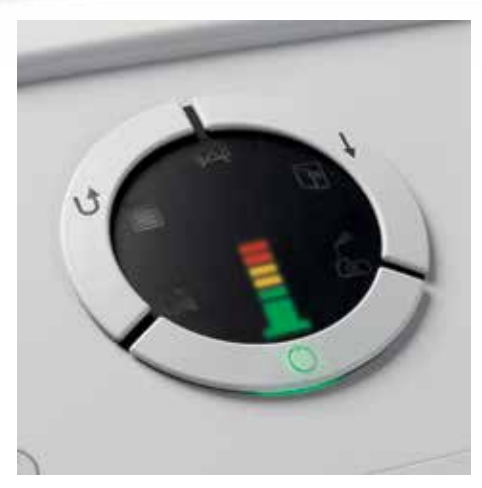
Paper quantity sensors prevent the document shredder from starting if too much has been fed in to avoid paper jams