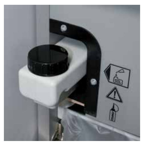
Integrated oil tank for controlled, automatic lubrication of the cross-cut cutters helps to lengthen service life while keeping performance constant