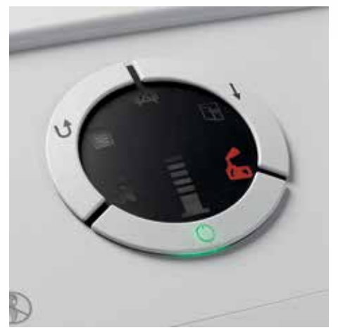
Clearly designed, user-friendly control panel signals oil refill