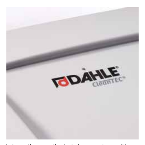
Automatic acoustic shut-down system with integrated microphone immediately stops the document shredder in an emergency in response to a call for help or knocks to the casing,