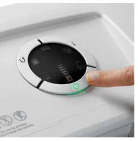
Clearly designed, user-friendly control panel permits easy, self-explanatory operation with illuminated symbols and acoustic signals